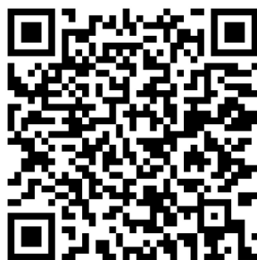
Wichita County Detention Center Guidelines