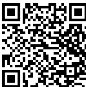
FMC Fort Worth Guidelines