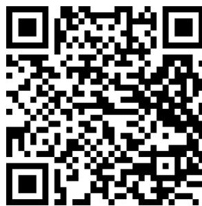
FMC Fort Worth Guidelines