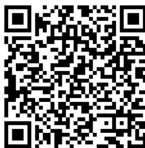
Johnson County Detention Center Guidelines