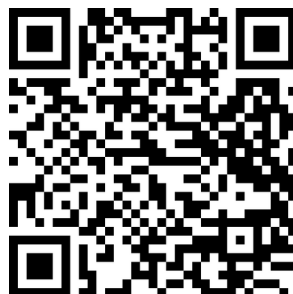
FMC Fort Worth Guidelines