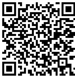
Wichita County Detention Center Guidelines