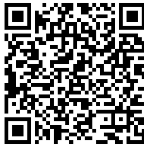
Johnson County Detention Center Guidelines