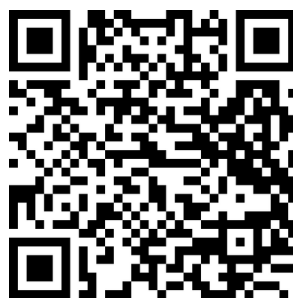
FMC Fort Worth Guidelines