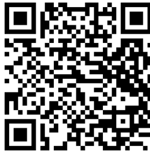
FMC Fort Worth Guidelines