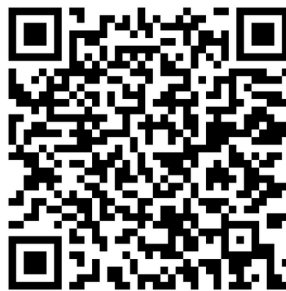
Wichita County Detention Center Guidelines